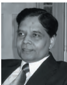
Arvind Panagariya is a Professor of Economics and the Jagdish Bhagwati Professor of Indian Political Economy and Director of the Program on Indian Economic Policies at Columbia University, New York.

We tested this hypothesis using Rounds 57 and 63 of the National Sample Survey Organisation's (NSSO) firm-level surveys of service sector firms carried out in India in 2001-02 and 2006-07. 1 The first of these surveys was done in the lower-growth period and the second in the higher-growth period. Moreover, since significant liberalising reforms such as the end to licensing on consumer goods imports and substantial cuts in tariffs were undertaken during the first half of the decade 2000-2010, the first survey can be thought of as having been done in the pre-